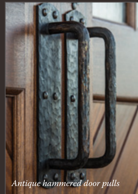
Antique hammered door pulls