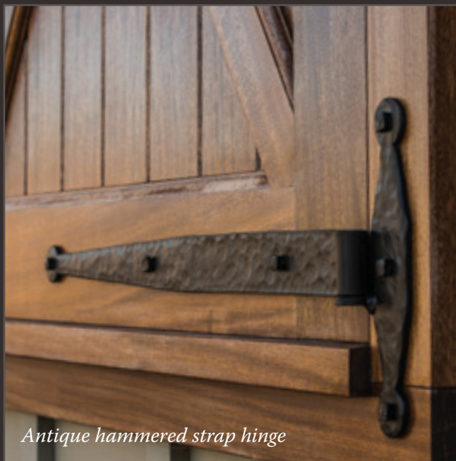
Antique hammered strap hinge