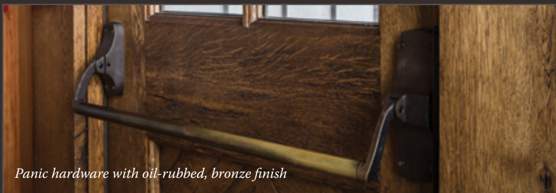
Panic hardware with oil-rubbed, bronze finish