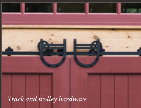
Track and trolley hardware